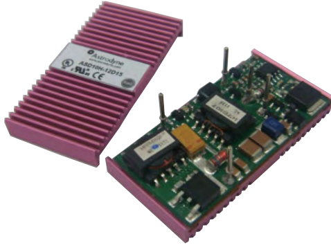
Unit measures 1"W x 2"L x 0.41"H