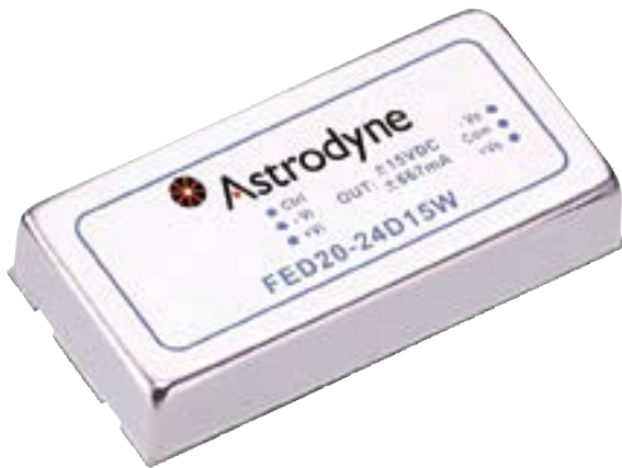
Unit measures 1"W x 2"L x 0.4"H